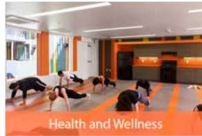
Health and Wellness