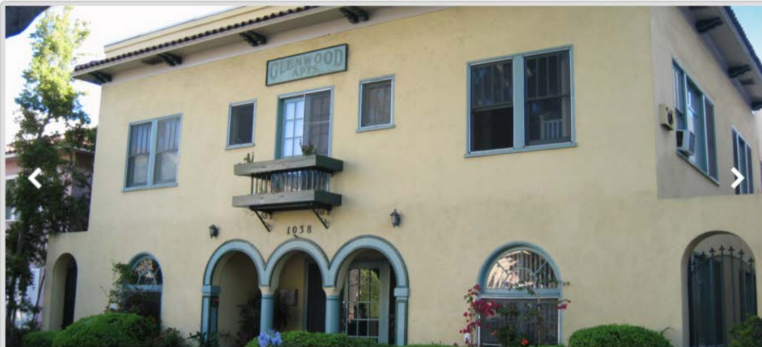
1038 2nd Street

Community Corp. works to restore neglected properties and preserve historically significant structures for the future. Renovating existing buildings improves neighborhoods and reduces the amount of natural resources used for housing – the greenest building is the one that has already been built. We are also constantly inspecting our properties to identify issues and implement on-going retrofits to improve them.